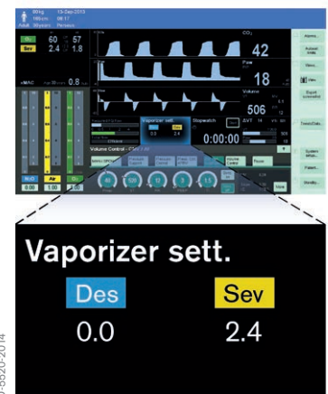
Communication with the Perseus® A500 Vaporizer identification and the control dial position of 2.4.

Optimized to seamlessly communicate with the Perseus A500, the Vapor 3000 series offers a new level of convenience. When mounted on the Perseus A500 with the Vapor Communication function, vaporizers are automatically recognized and identified. The type and control dial setting of each vaporizer can easily be viewed directly on the screen of the Perseus A500. Now, clinicians have a single location to view vaporizer settings, measured anesthetic agent concentrations and other essential ventilation information – without sacrificing the feel and functionality of mechanical vaporizers. Additionally, low vaporizer filling levels are automatically indicated by an acoustic signal and visual alarms on the Perseus A500 screen and vaporizers.