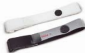
Breathable textile headband 4606200

In addition to the breathable textile headband, R.WOLF also supplies extremely hygienic and cost-effective disposable headbands for all applications requiring new headbands (20 disposable headbands in one set, 1 fixing pad).