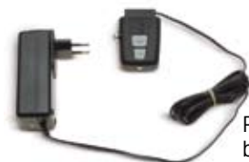
Power pack battery adapter 4601000