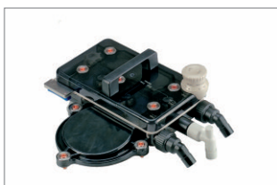
Compact Breathing System Easy to mount and disassemble breathing system with integrated heater.