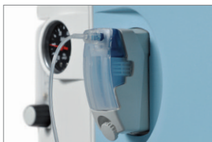
Infinity ID WaterLock 2 The ID WaterLock 2 tells you when to exchange it.