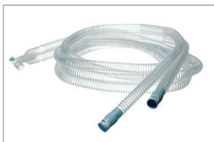
Infinity ID Breathing Hoses The ID breathing circuits offer a new and wide range of comfort properties.