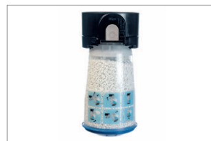
Infinity ID CLIC Absorber Easy to change soda lime cartridges, even during operation.